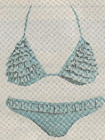
Ruffle bikini, £24, Miss Selfridge , 0845 121 4517