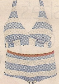
Blue and white stripe, £30, Joules , 0845 606 6871