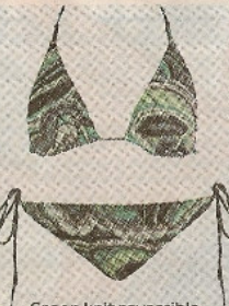
Green knit reversible, £180, Missoni at Harvey Nichols , 020 7235 5000