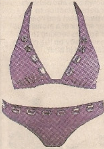
Purple with jewels, £6, Primark , 01189 606300