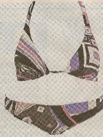
Geometric, £240, Pucci at Selfridges , 0800 123 400