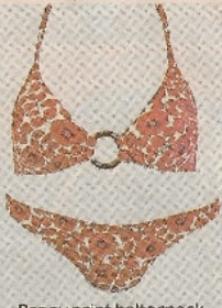
Poppy print halterneck, £120, Heidi Klein , 020 7259 9418