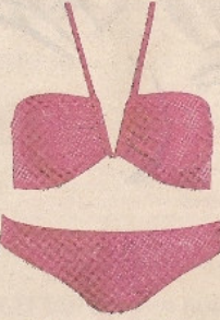
Pink bandeau, £18, Asos , www.asos.com