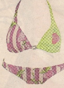
Strawberry print, £69, www.swimhut.com