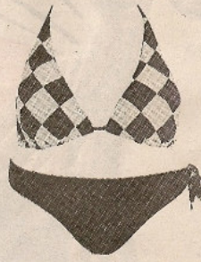
Check bikini, £69, Samantha Sage , 0870 608 8988